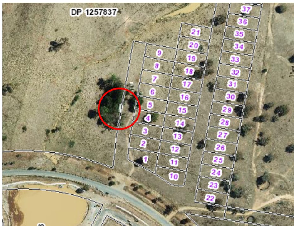
Sunset ruin shown in red circle (note that the new subdivision should be shown slightly to the right (east). Six Maps

The historic ruin is listed in QPLEP as McCawley "Sunset" Homestead Complex at 141 Googong Road, Heritage Item 285.